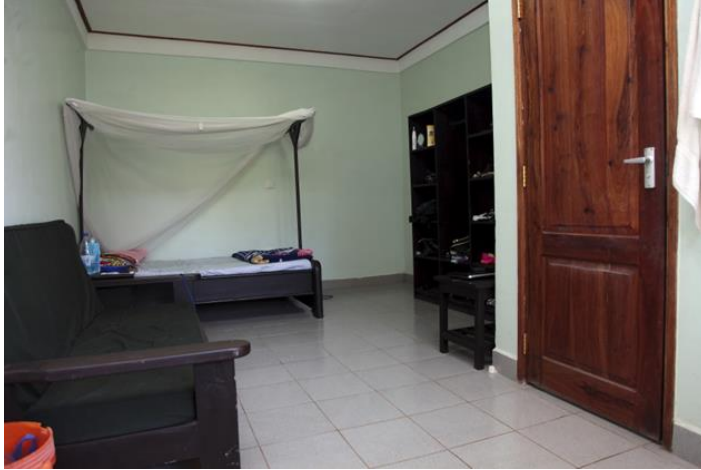
Each room has an en-suite

Whilst in Arusha, we will stay in visitor accommodation at The School of St Jude. Accommodation is located within the grounds of the Primary School Campus. The accommodation is basic, but clean and safe.