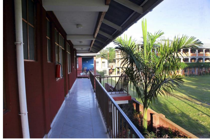
Grounds of the primary campus at St Jude's

Whilst in Arusha, we will stay in visitor accommodation at The School of St Jude. Accommodation is located within the grounds of the Primary School Campus. Each room will be a private room with an en-suite, some have a small lounge.